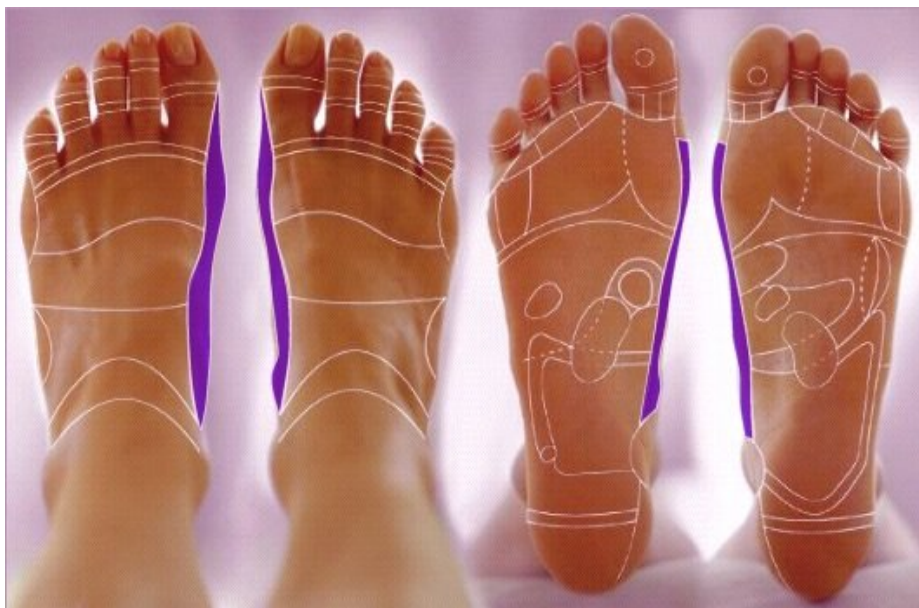
Figure 1: The reflex points of low back and spine are marked with dark color as different from other reflex points of the body

According to Wall and Melzak, VAS is a valid and reliable scale for measuring the pain intensity [16]. In his book, Magee also affirms the validity of the scale [12]., The American College of Sports Medicine (ACSM) also confirms the aforesaid statements regarding the validity and reliability of the scale and suggests it as a non-aggressive test [7]. Some foreign and domestic researches which have drawn on this method to measure the pain intensity and have yielded favorable results [17, 18, 19, 20, 21, 22, 23] also confirm the reliability and validity of VAS scale.